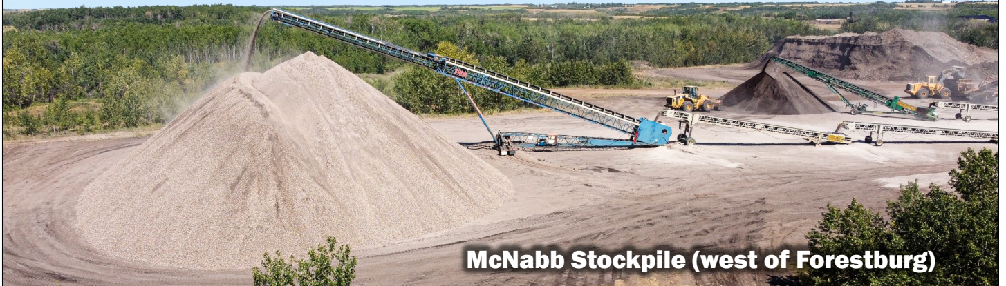
McNabb Stockpile (west of Forestburg)

Flagstaff County does not haul gravel for ratepayers; hauling arrangements must be made by the ratepayer. The intent of gravel sales is for use on private lands for laneways and yard sites.